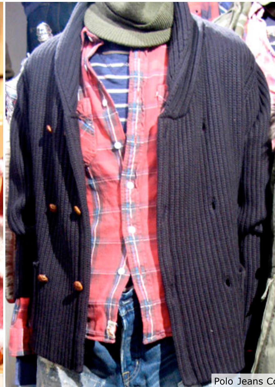
Polo Jeans Co