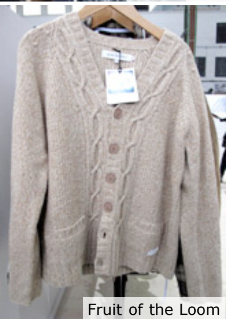
Fruit of the Loom