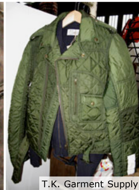
T.K. Garment Supply