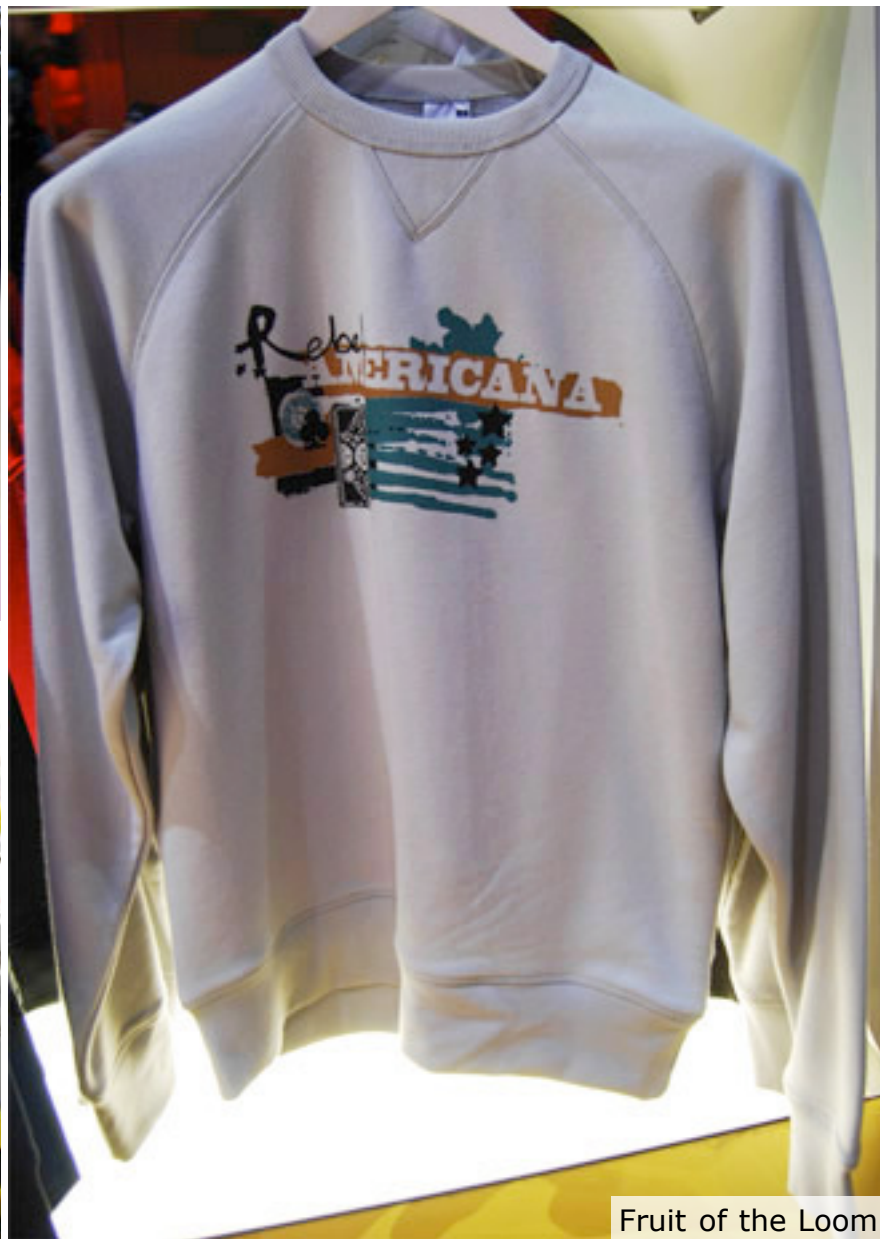
Fruit of the Loom