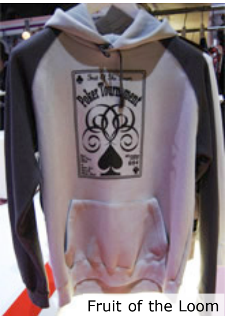
Fruit of the Loom