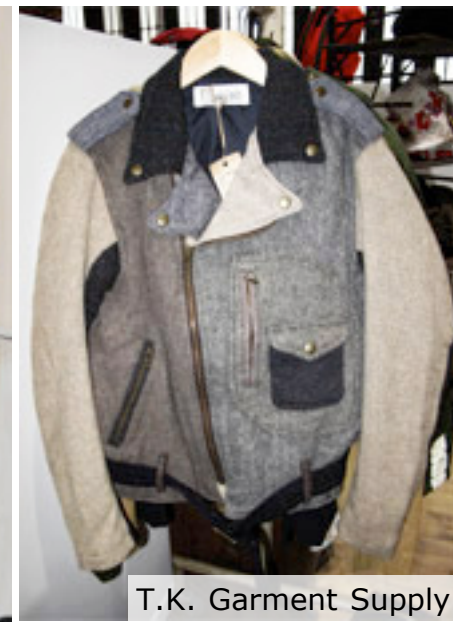
T.K. Garment Supply