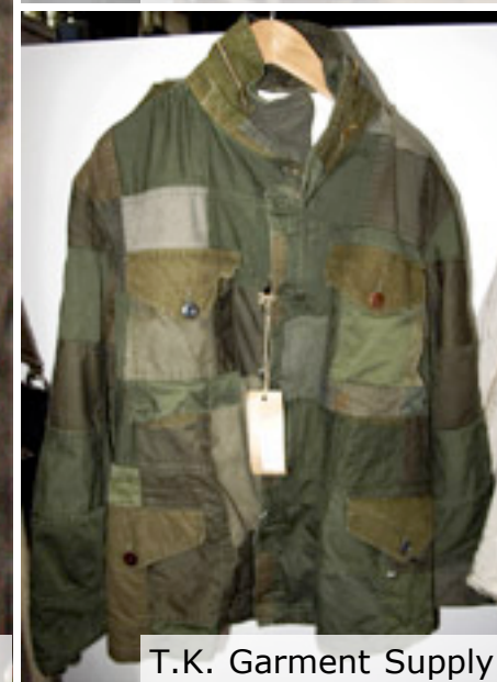
T.K. Garment Supply